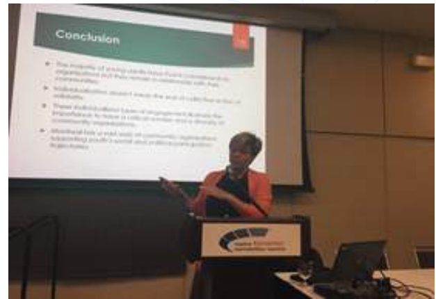
Participants at the RC48 Sessions - XIX ISA World Congress of Sociology, Canada.