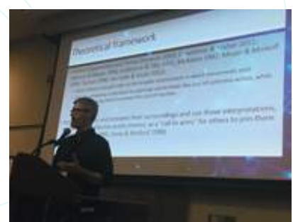
Participants Session 'Collective Action in the Digital Age' - XIX ISA World Congress of Sociology, Canada.