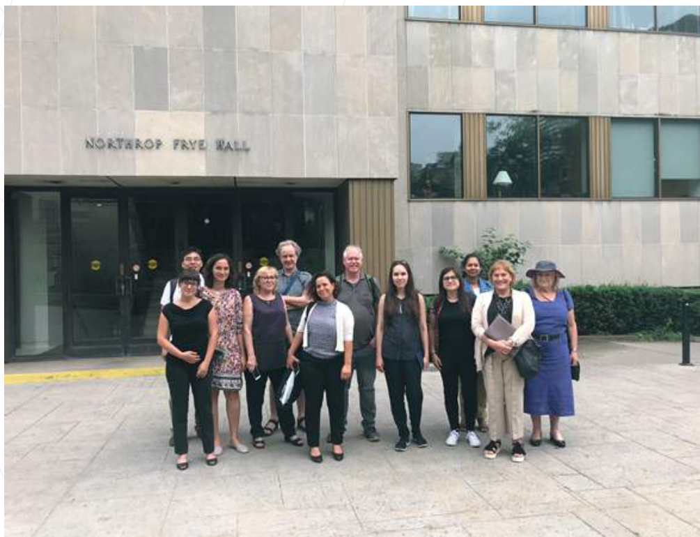
Participants at the Second PhD Workshop ISA – RC48, Canada.