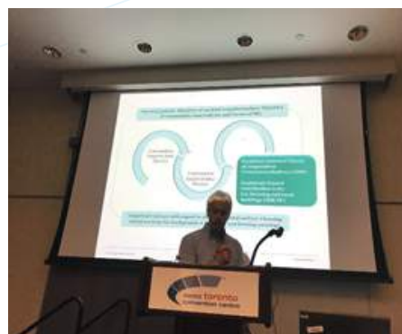
Participants at the RC48 Sessions - XIX ISA World Congress of Sociology, Canada.