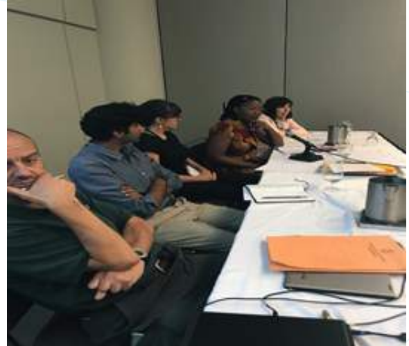
Participants Session “Different Facets of Urban Unrest – Untangling Urban Collective Action’ - XIX ISA World Congress of Sociology, Canada