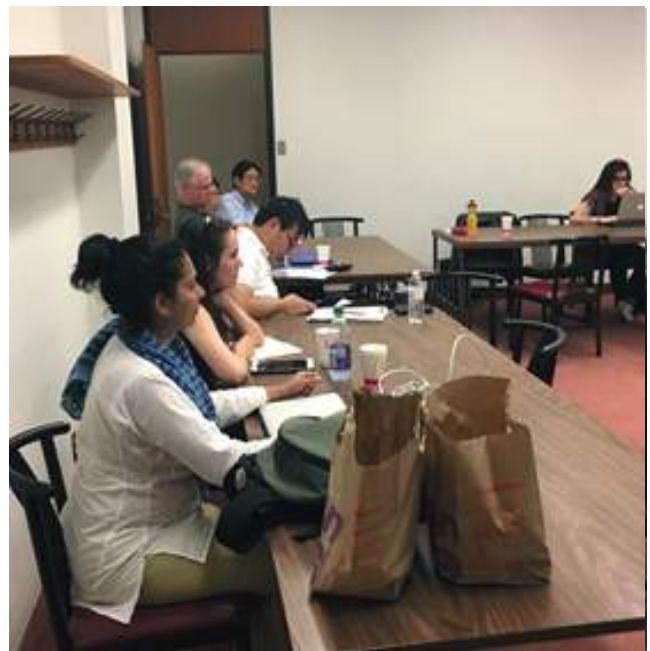
Participants at the Second PhD Workshop ISA – RC48, Canada.

“The RC48 PhD workshop, held on July 14, 2018 in Toronto (Canada) for the XIX ISA World Congress of Sociology, was a great opportunity to present my research concerning urban social movements and prefiguration. We had to provide in advance a 4,000 words paper on our subject so that researchers and PhD scholars could comment it. It gave me the chance to benefit from feedbacks and suggestions from well-known academics in social movement analysis. It was particularly interesting to benefit from different points of view and expertise concerning this field of research. PhD students could surely appreciate the workshop as well with a shorter text to produce, especially if there is no collective publication following the workshop. The