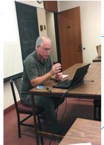
Participants at the Second PhD Workshop ISA – RC48, Canada.

“There is no doubt that for both a PhD candidate and for a senior researcher, a professional community of researchers is an essential and productive element. The RC48 Ph.D. Workshop attended in July certainly generated this kind of encounter between social movement researchers. The atmosphere during the day was friendly and professional at the same time and constituted a safe ground for creating professional connections. More important, each participant was given the opportunity and sufficient time to present the article and to receive substantial, in-depth and to a great extent innovative, feedback from one of the senior researchers as well as from the rest of the participants. In addition, although this is a workshop under the umbrella of sociology and more specifically under theories of social movements, participants came from a wide range of countries and areas of practice. This has allowed us to develop discussions from a variety of perspectives that have enabled young researchers to discover points of view, ways of thinking and interpretations that have so far out of their sight. In addition, the workshop and the relationships that were formed did not remain in the room, but rather continued to develop and become significant during the rest of the conference through random meetings, discussions, and ideas for cooperation”.