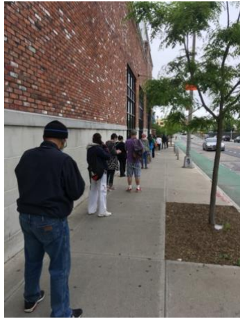
Figures 1. and 2. Repurposing Front Spaces: a. Work Space, b. Play Space Figure 3. Long Lines at Local Stores