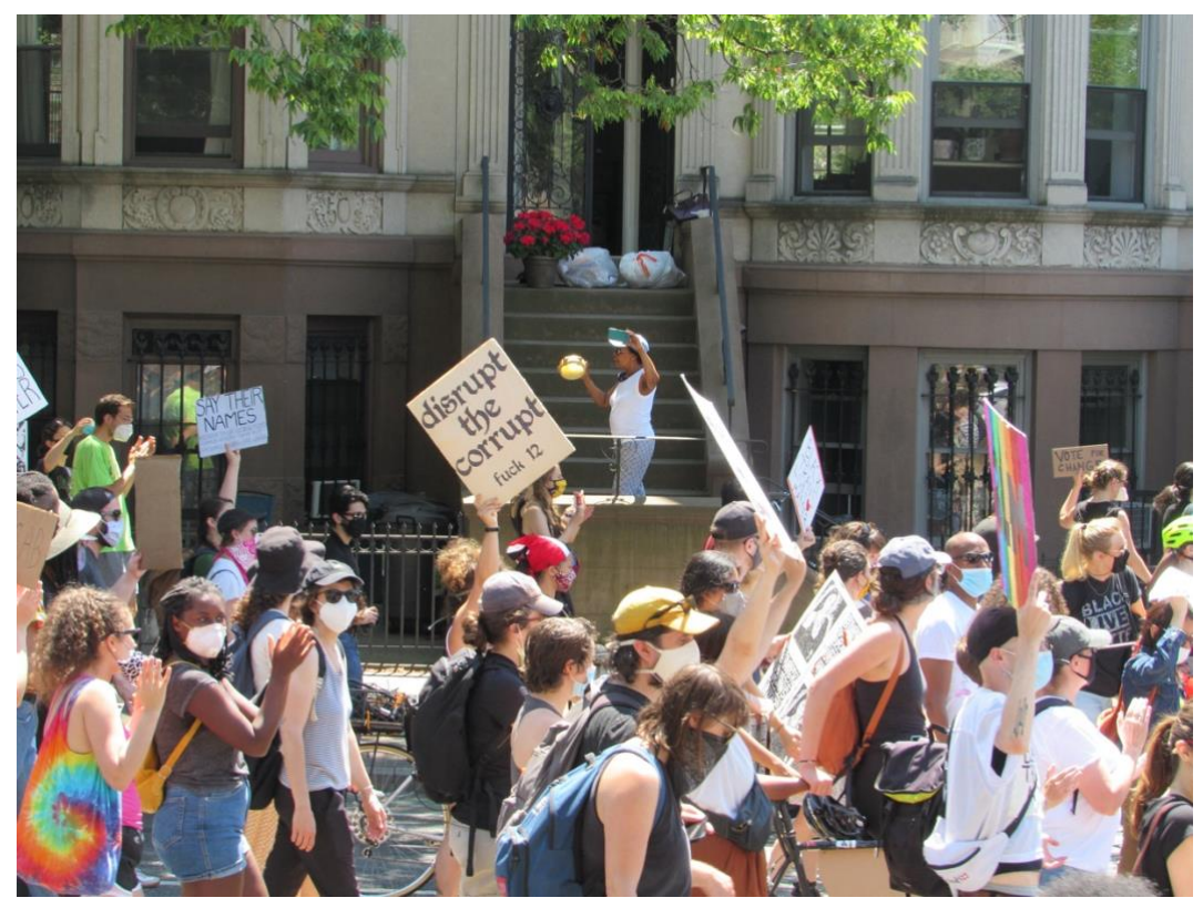
Figure 6. Protesting at Home