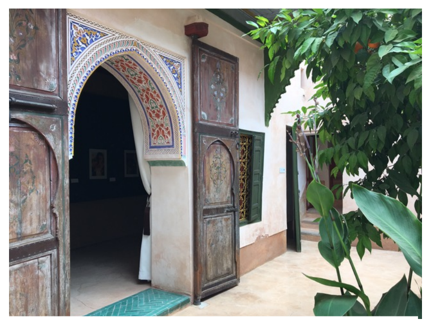
Courtyard of a museum in Marrakech

It is always interesting to learn about the work of TG06 members – you'll find some exciting projects and publications (and honours!) described in the following pages. All of this activity is yet more evidence that it is time for us to upgrade from an ISA Thematic Group to an ISA Working Group. Working Group status will better represent our membership numbers, diversity and activity, and it is the next step toward