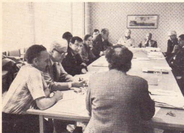
Executive Committee meeting

This brief summary leaves out much detail and all discussion. Still, we hope that you found it informative.