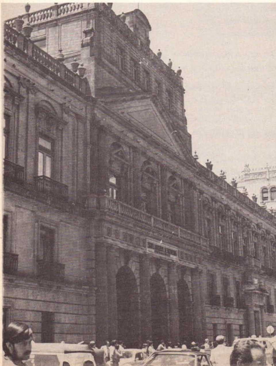
Palacio de Minería Main site of the Congress