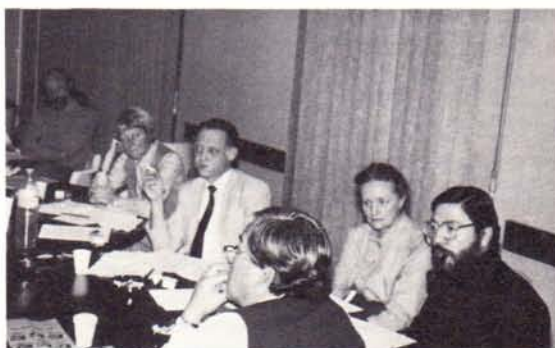
Meeting with the Indian Delegation