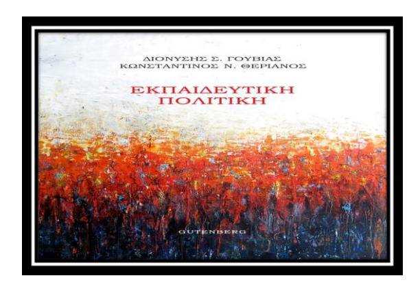
EDUCATION POLICY, by Dionysios Gouvias & K. Therianos ,[Gutenberg Publications, Athens, October 2014, pp. 469]

This book's main goal is that readers (mostly undergraduate & postgraduate students and academic teachers, researchers and, of course, active teachers) get acquainted with basic Educational Policy (EP) issues in contemporary societies, at the dawn of the 21st century. The topics covered in the first part (9 chapters) are of a rather general theoretical, epistemological and methodological nature (scientific disciplines involved in studying EP, concepts & theoretical models for the study of EP etc.), and in the remaining chapters (8 in total) of a more specific, policy-orientated character (e.g. issues of "gender", "multiculturalism", "evaluation", "ICTs", or of the role of international agencies in global educational policy-making).