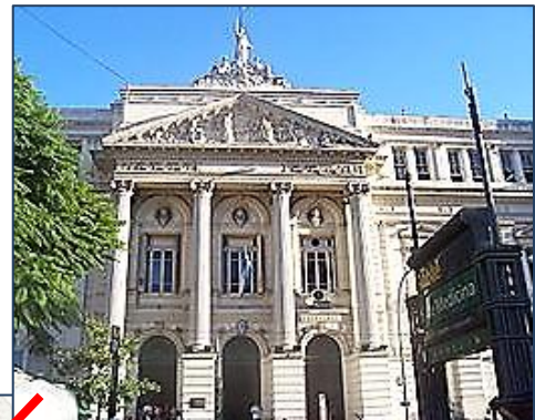
The University of Buenos Aires’s Facultad de Economía (Faculty of Economics)

Conference Venues: We expect all our events to take place at the University of Buenos Aires’s Facultad de Economía (Faculty of Economics), Avenida Córdoba 2122. This is across the park Plaza Bernardo Houssay , corner of Junín . The subte (subway) has a stop right there, named after the nearby “ Facultad de Medicina ” (Faculty of Medicine). The exact rooms for our sessions have not been determined yet. Please double-check for more details and any changes upon arrival.