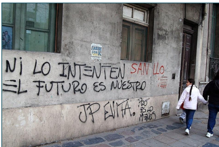
"Don't even try, the future is ours!" ("Ni lo intenten, el futuro es nuestro"). A young child looks back at the graffiti on a house-wall while walking forward at the hand of her mother in an embattled working-class neighborhood of Buenos Aires. (Photo taken August 2011.)