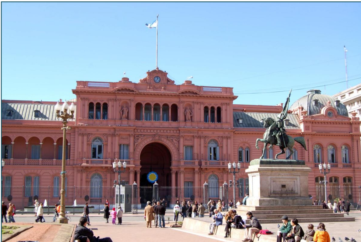
Sunny afternoon in August the year before the ISA Forum in Buenos Aires: The neoclassic presidential palace called Casa Rosada (Pink House) at the Eastern end of the Plaza de Mayo (May Square, named after the May Revolution of 1810, which started the War of Independence from Spain) with an equestrian monument to the independence fighter General Manuel Belgrano.

The abstracts appear here in the language in which they were submitted by the authors. The official languages of the International Sociological Association are English, French, and Spanish, with English being the de facto most often used. In order to facilitate discussion across linguistic lines, presenters are encouraged to provide their audience with handouts or visual aids in languages other than the one in which the paper is presented or written.