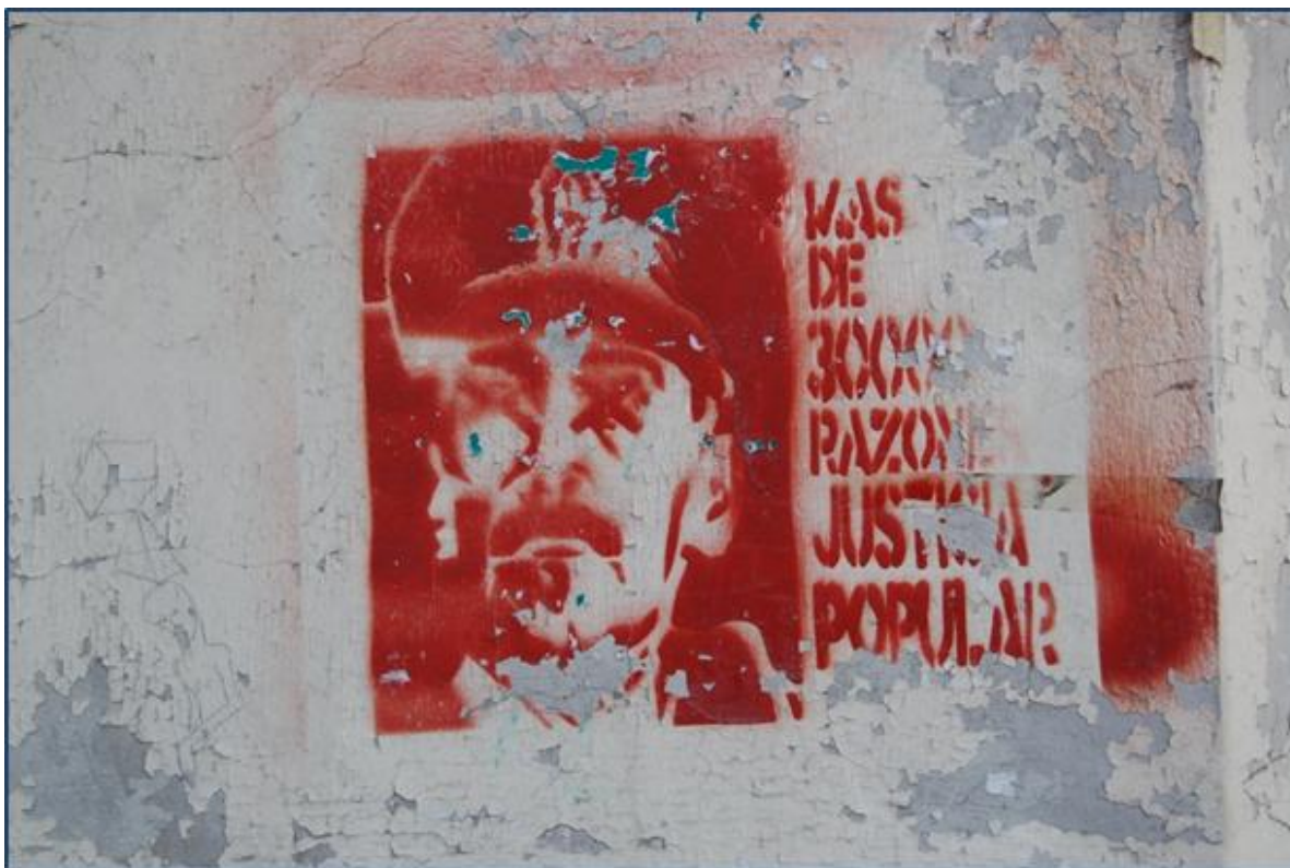
"More than 30,000 reasons: Popular justice" (" Mas que 30,000 razones: Justicia popular "): Graffiti seen on a house-wall in Buenos Aires's central Avenida de Mayo , August 2011.