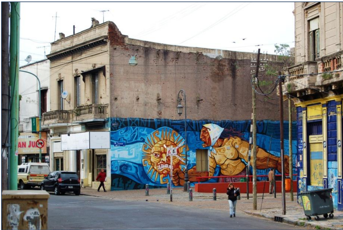
Street scene, Buenos Aires, August 2011.