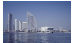
Minato Mirai: Harbor of the Future

Located half an hour south of Tokyo by train, Yokohama is Japan's second largest city and the capital of Kanagawa Prefecture. Yokohama's international flair is rooted in its unique history as Japan's first "treaty port." Towards the end of the Edo Period (1603-1867), during which Japan maintained a policy of self-isolation, Yokohama's port was one of the first to be opened to foreign trade in 1859. Consequently, Yokohama quickly grew from a small fishing village into one of Japan's major cities.