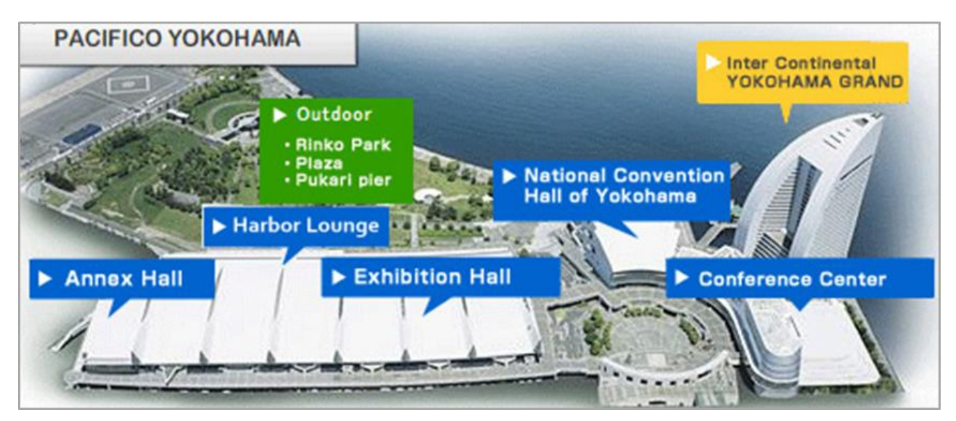
Aerial view of the Pacifico Yokohama Congress Center and its immediate surroundings

Climate: The temperature in Yokohama in July is said to vary usually from 23°C (73 F) to 28°C (83 F), though there have been record lows of 13.3 °C (56 F) and record highs of 36.9 °C (98F), average humidity 72-80%. The Congress venue is air-conditioned.