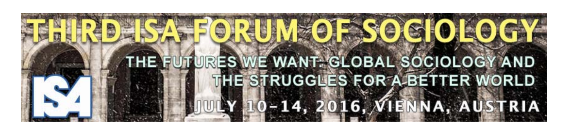
CALL FOR SESSIONS, ISA FORUM 2016, VIENNA/AUSTRIA

The Research Committee on Clinical Sociology (RC-46) will be organizing a total of 15 sessions at the 3rd ISA Forum 2016 in Vienna, Austria, 10-14 July. One of these sessions will be a business meeting devoted to discussion of RC46's plans for the next congress in Toronto in 2018 as well as general developments of our research committee. This session will be organized by the 2016 Forum