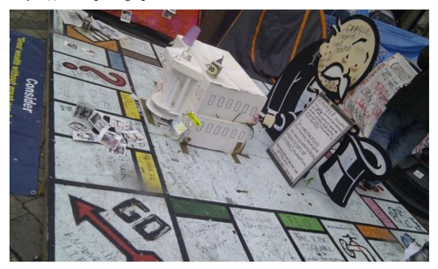
Photograph from the Occupy London Camp, St Paul's, London, UK, November 2011