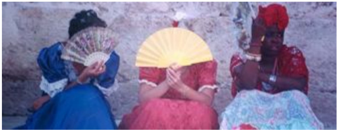
The eye is drawn first to color, second to composition, and only third to wonder about the subjects. But what are they thinking, feeling, expecting?

Caption: Craig Calhoun