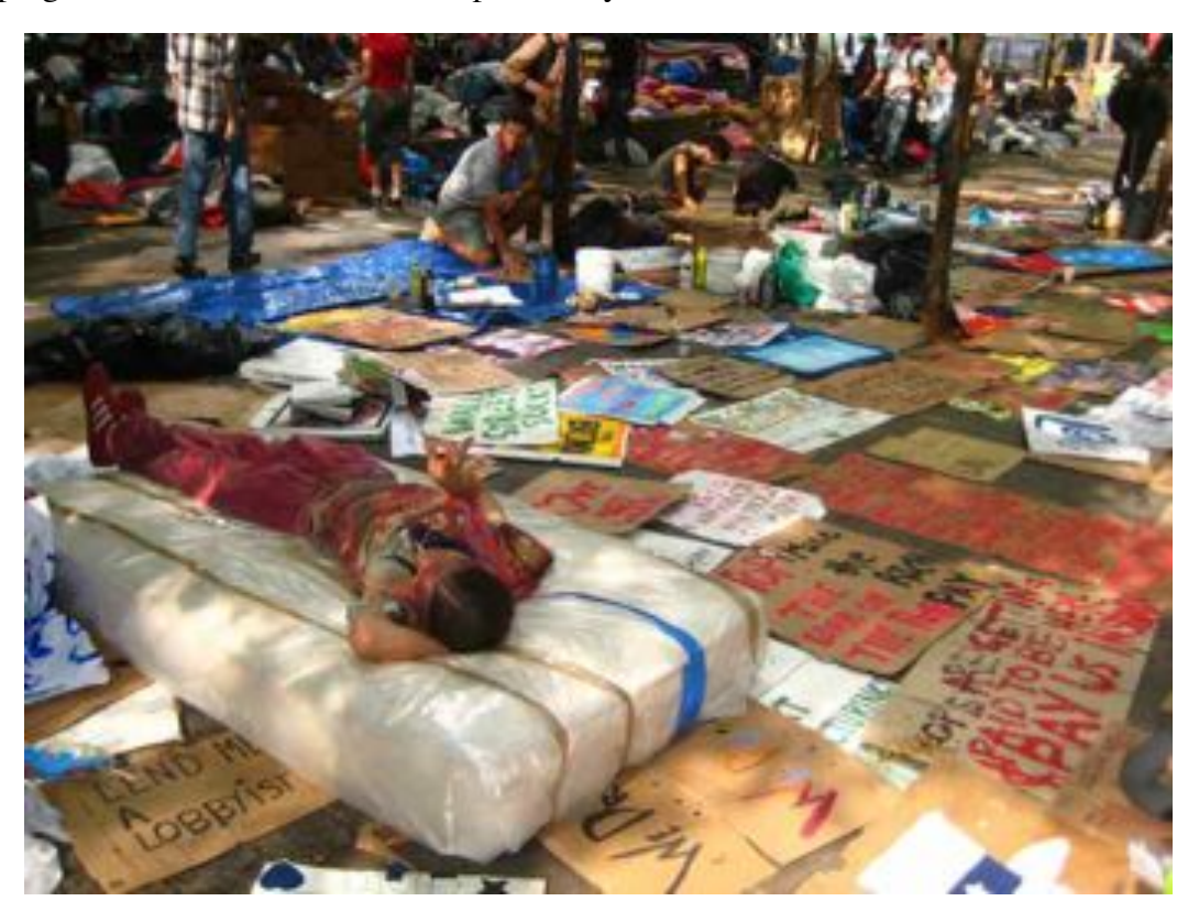
Protesters camping out in the Financial District.

"I'm out here to raise awareness basically that Wall Street is stealing our assets and stealing not only our natural resources, but also our human resources," said the unemployed 37-year-old from Connecticut who has been camping out at Zuccotti Park since Sept. 17, day one of the demonstration.