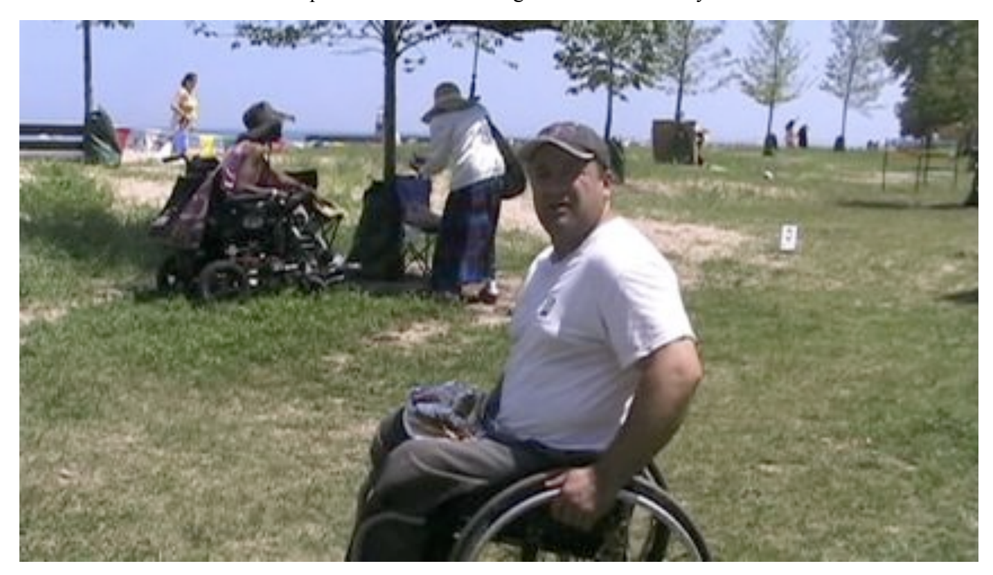
A still cut from the video created by Ivonne Canellada

course of the second year that inspired me to develop this course as a form of participatory research. While discussing video topics, a contentious debate on racism broke out among the participants, prompting the participants to cope with each other and the issues they raised. I think this happened partly because collective video production stimulates people to think reflexively and critically. Creating something out of nothing is completely different from responding to text prepared by others. Video production compels participants to identify a problem and support or visualize their ideas about it. In so doing, they not only tell their stories but also learn more about them, thereby becoming collaborating researchers! Noting the great potential for participatory research, I began to reorganize the course as a research site for the following year, and in 2010 oversaw a more comprehensive course that generated data for my doctoral thesis.