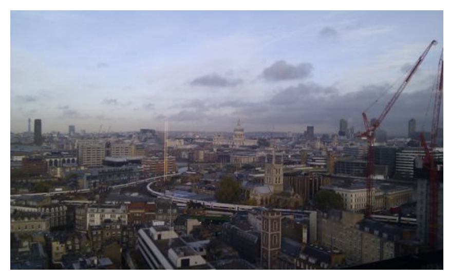
London from Guy's Hospital, London, UK