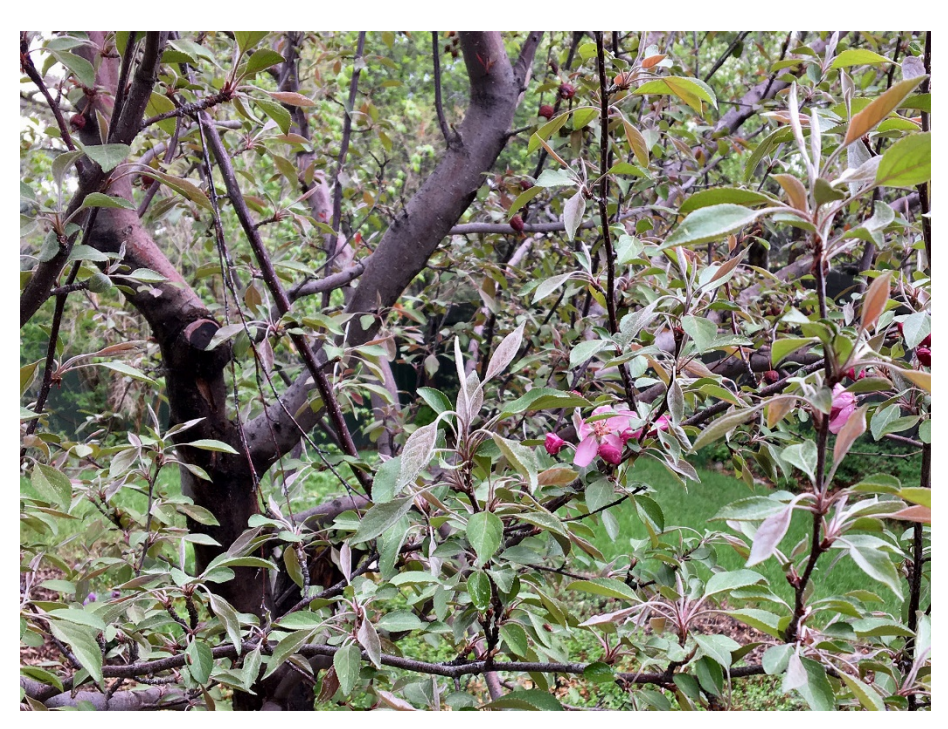
First tree blossoms in the garden

For TG06 Institutional Ethnography, exciting days are coming up in July, when we meet in Toronto for the ISA World Congress. The list institutional ethnography sessions appears on page 4 of this newsletter it's an intriguing and varied collection, with presenters, discussants and chairs from different countries. I'm lookina forward to hearing as many of the presentations as possible.