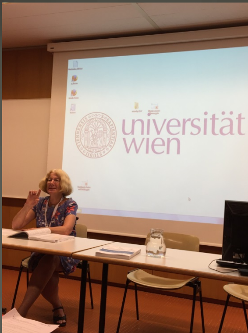
Presenters at the Third ISA Forum, University of Vienna