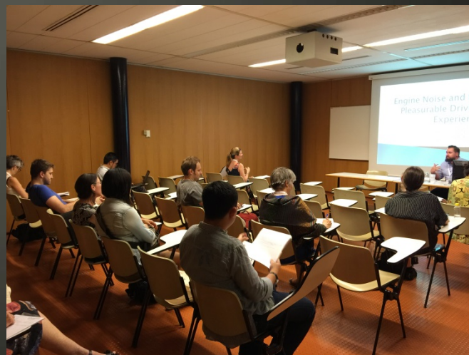
Presenters and participants at the Third ISA Forum, University of Vienna