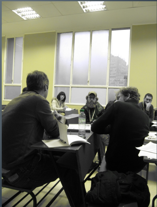
Exchanging ideas during one of the Q&A sessions.