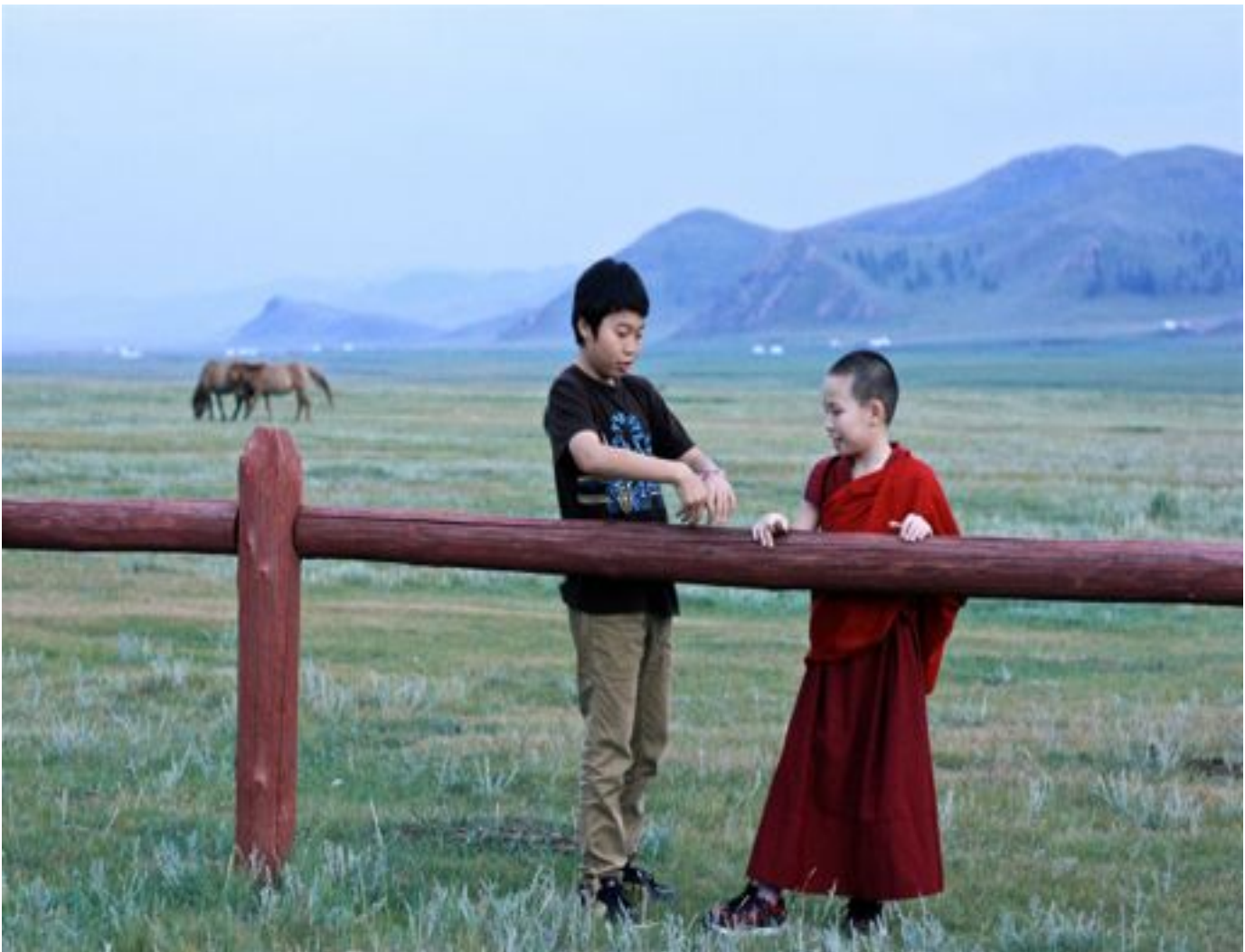
Steppe Childhoods.

Two boys chatting in front of Amarbayasgalant Monastery in the far north of Mongolia. Horses graze peacefully to the left and in the far background, nomads' yurts (Mg. gers) may be seen lining the base of a mountain range that conceals the setting sun. When the taller boy's parents begin speaking with the older lamas, he takes the opportunity to strike up a conversation with a monk his own age. Quickly and quietly, they become like old friends in just a few moments. Local legend tells that this monastery was founded to be the resting place of Zanabazar, the first great lama of the Khalkha Mongols in the seventeenth century when a search party saw two local boys playing on the grasslands. The party took it as an auspicious sign, and chose that place to build the monastery, which they named after the two boys (Mg. "Amur" and "Bayasqulangtu"). This scene nostalgically brings us back to that moment, though it remains firmly in the present in so many ways.