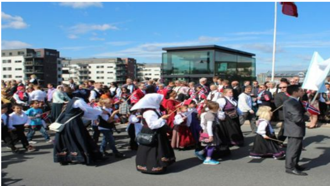
Picture 1. Inhabitants of Drammen dressed in traditional Norwegian costumes ( bunad ) celebrating May 17, Norwegian Constitution Day, by taking part in the parade. Norwegian flags dominate the landscape. Some of the participants are veiled combining elements of Muslim heritage (a scarf) with a Norwegian national costume. A few Muslim women of immigrant backgrounds told me they wished they could afford to have their own bunad . The prices of the costume range from $2,000 to $10,000, making the bunad a status symbol. The majority of immigrants from lower social classes cannot afford one and consequently wear other kinds of elegant clothing during the parade.

This essay focuses on the mixing of cultural practices by ethnic Norwegians and immigrants. Although it is limited to showing what both host and immigrant population have in common, it does not deny other aspects of immigrants' existence, including their "otherness" in the host society, which is often caused by poor economic conditions, the concentration of immigrant housing in less attractive districts of the city, and a difference in habits originating from immigrants' cultural backgrounds. The aim of this essay is to draw the reader's attention to the complexity of the cultural identification of inhabitants of a multicultural city and to underline bi-directional changes in the cultural practices of both ethnic and immigrant residents.