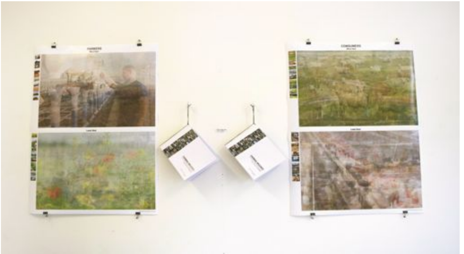
Katie Knapp: Farming Imagined