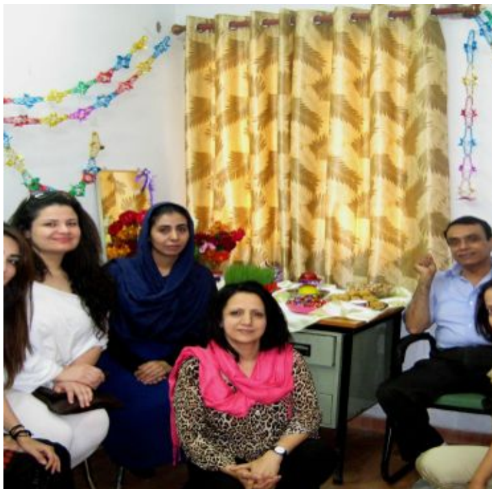
Iranian Students Celebrating 2014 Nourouz.

We celebrated Persian New Year (Norouz) on the 20th of March 2013 and again in 2014, in the same way that Persians have been celebrating Norouz in Iran for more than 3000 years. I took some photographs of the Norouz celebrations: two are of Norouz 2013, two are of Norouz 2014, and the other picture is of the Syndromic Room's door.