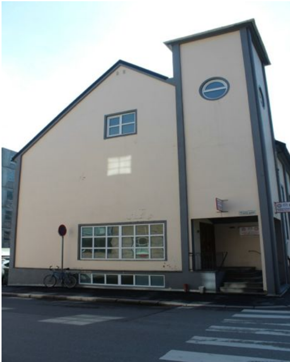
Picture 6. A former Adventist church bought by a Turkish community and transformed into a mosque for the Sunni Turkish community in Drammen.