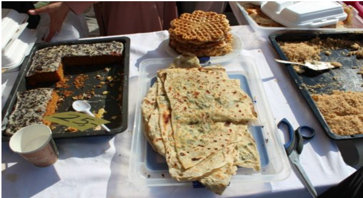
Picture 4. Norwegian vafler (waffles) and Turkish gözleme (a type of stuffed pancake) made and served by women of Turkish background during the Language and Culture Festival in Drammen. For dessert one could choose between carrot cake (popular in Western countries) and kadayıf, a favorite pastry in Turkey.