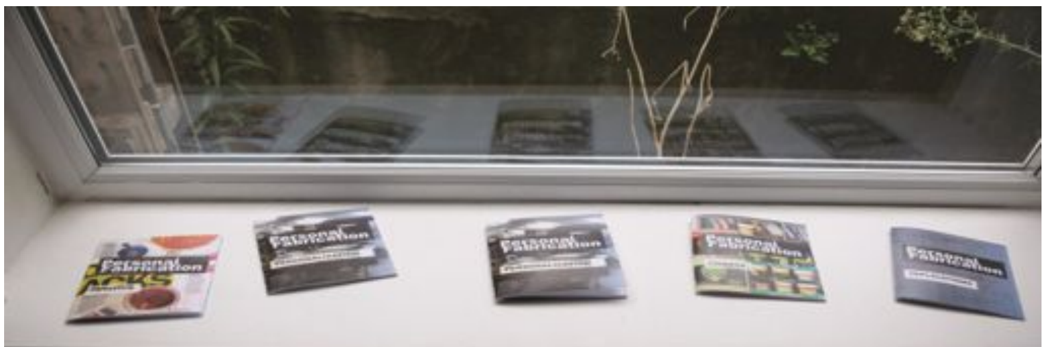
Ali Eisa: The Future of Personal Fabrication