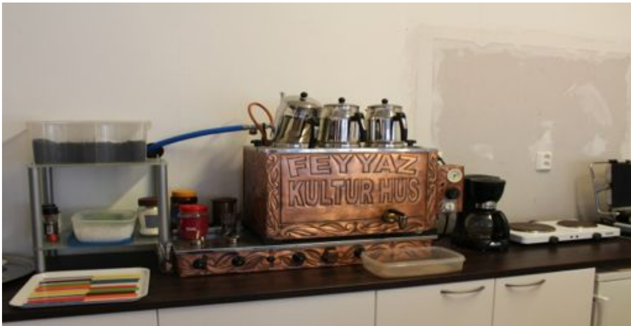
Picture 5. Traditional Turkish teapot with Turkish and Norwegian inscription on it. The Turkish word Feyyaz is a male name. The Norwegian word Kultur Hus (Cultural House) written with a spelling mistake 2 indicates a lack of fluency with the language. This machine is used in one of the centers where people of Turkish origin gather in Drammen.