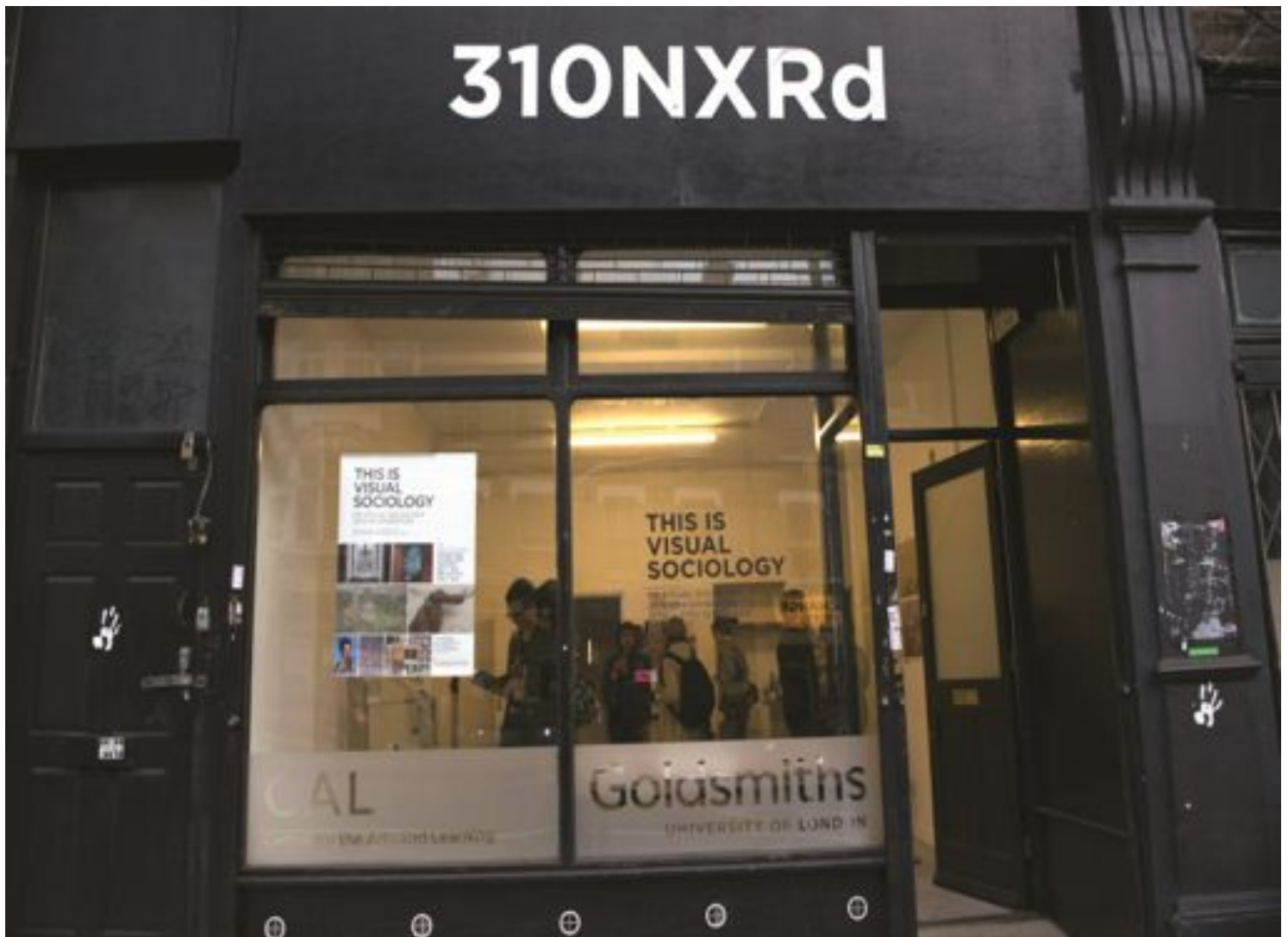
Goldsmiths MA Visual Sociology students exhibited their work to the public in September 2014.