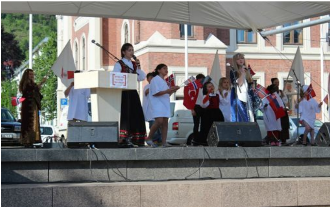
Picture 3. A girl of Turkish origin wearing bunad performing a song with a fellow ethnic Norwegian singer who is wearing a traditional Turkish dress that refers to Ottoman heritage. Each child on the stage holds two flags: one Norwegian flag and a flag of their country of origin. Here, besides Norwegian, Turkish, British, and Slovakian flags are visible.