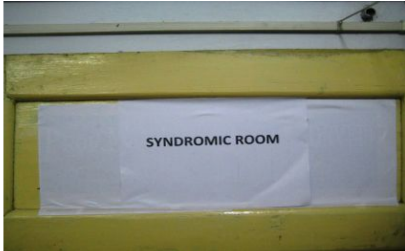
Syndromic Room, Sociology, BHU.

We celebrated Persian New Year (Norouz) on the 20th of March 2013 and again in 2014, in the same way that Persians have been celebrating Norouz in Iran for more than 3000 years. I took some photographs of the Norouz celebrations: two are of Norouz 2013, two are of Norouz 2014, and the other picture is of the Syndromic Room's door.