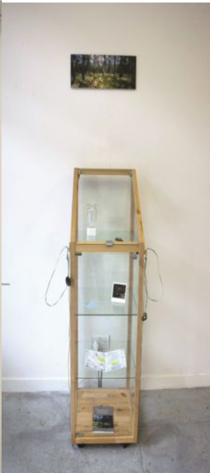
Roz Mortimer: Traces