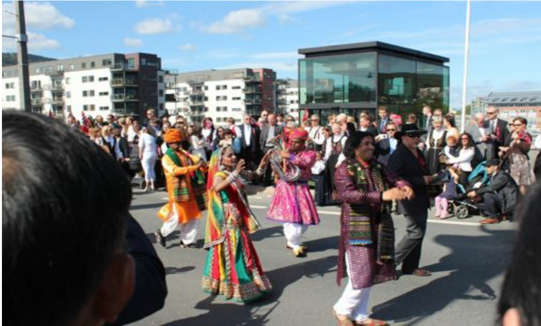
Picture 2. Not only the bunad is welcomed during the parade. A group of Indian artists in traditional costumes perform a traditional folk dance