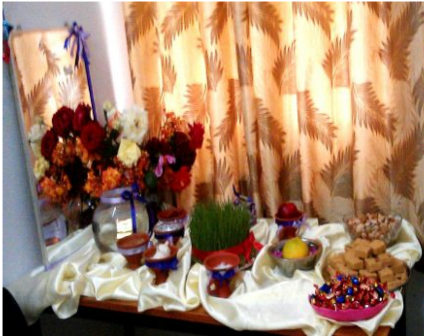
Nourouz Haft Seen, 2014.

Some other items that are usually added to the Sofreh include: