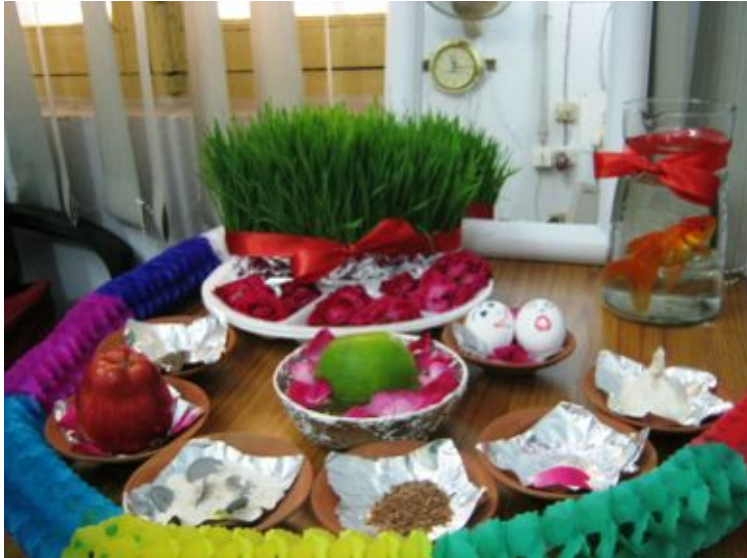
Nourouz Haft Seen, 2013.

The seven dishes stand for the seven pure signs of life – reproduction or rebirth, health, happiness, prosperity, joy, patience, and beauty.