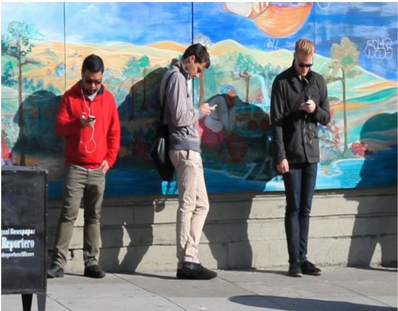
Waiting for the Facebook Bus, 24th and Valencia.

Three men stand on a sidewalk in San Francisco. They stand equidistant from each other, not even their shadows touching. In any event, they are more engrossed in the smartphones they hold than in anything going on around them. With heads bent forward, they click away; two of them are further buffered from their environment by sunglasses and headphones. Their backs are to a colorful mural of a hillside and waterfront, perhaps imagining San Francisco as it was in the days of Spanish rule. They do not notice the woman depicted in it who appears to gaze out at them as she kneels to collect water, perhaps marveling at a future world that bears little resemblance to her own.