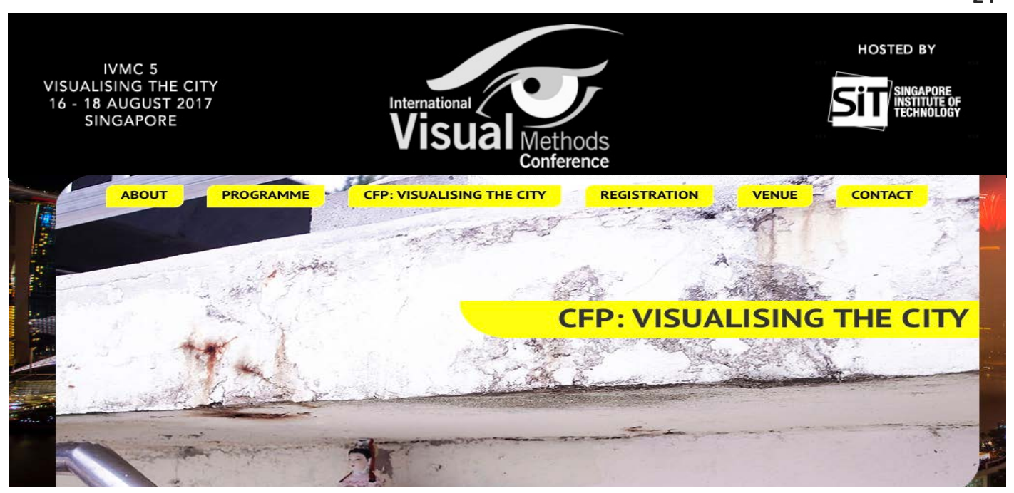
CALL FOR PANELS, PAPERS AND OTHER CONTRIBUTIONS

The phenomenon of cities is an increasingly important aspect of the everyday life of individuals. The United Nations reports that as of 2014, 54 percent of the world's population live in urban areas, with that proportion rising to 66 percent by 2050. Asia and Africa are projected to contribute the most to this growth. Cities come in, and are engaged with, on a variety of scales, shapes and interactions. From global cities to urban neighbourhoods to the bedrooms of our informants, from walking to sensing to mapping the city – the ways in which we have seen, experienced and documented cities are myriad.