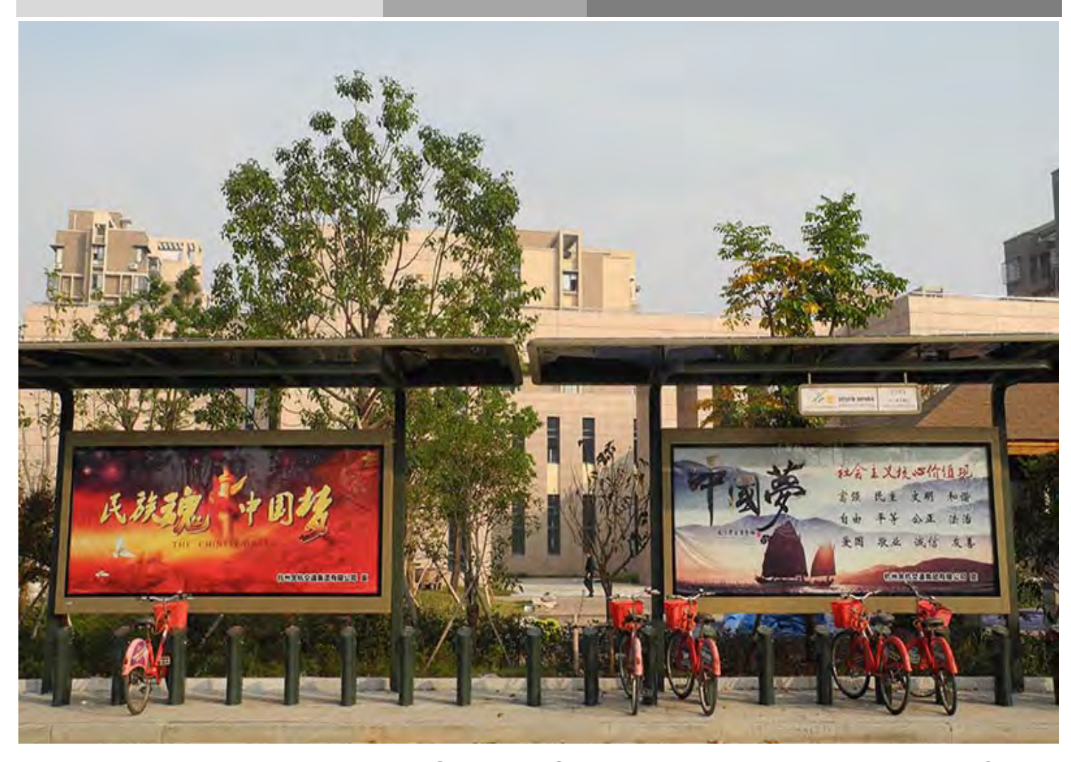
Fringescapes: Hangzhou Future Sci-Tech City (Valentina Anzoise, 2016) one of a series of images exhibited at the University of Central Lancashire for the Fieldwork Symposium .