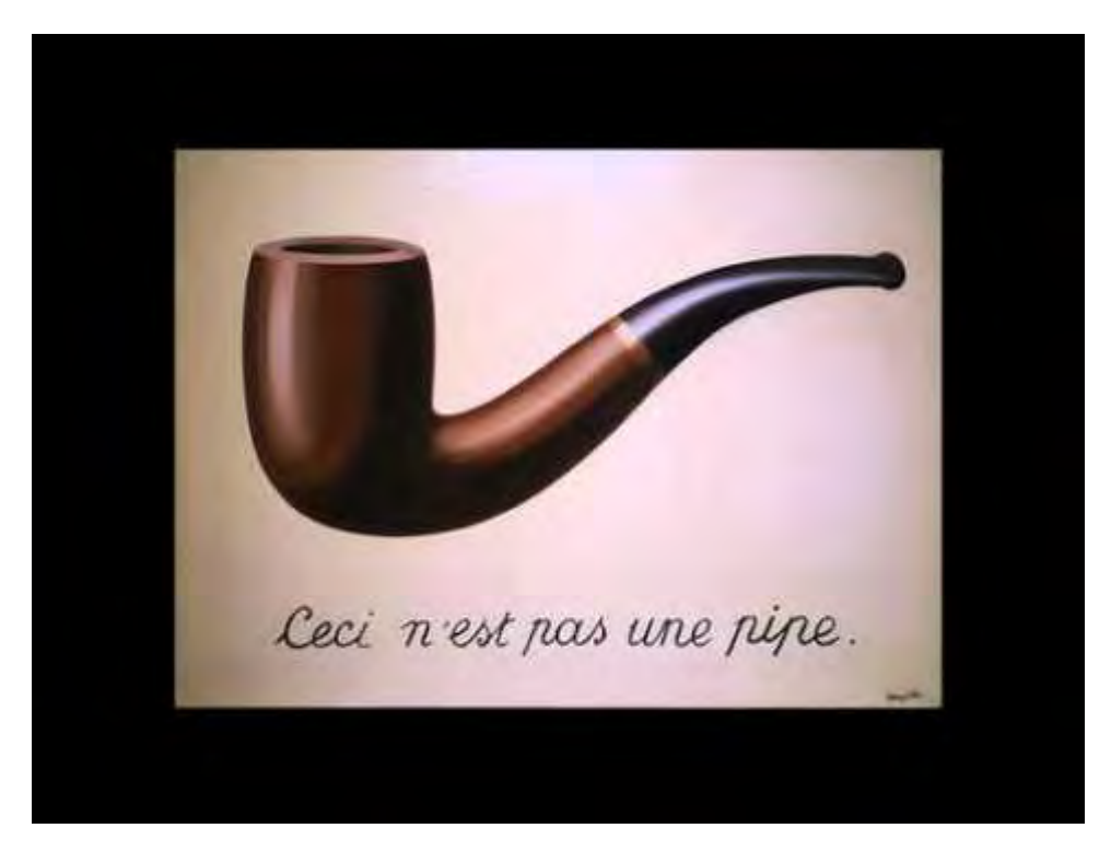
Ceci n'est pas une pipe (1929) Rene Magritte