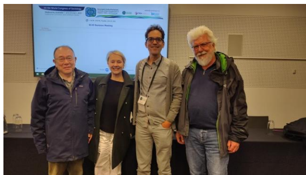
2 - The current and previous presidents of RC49