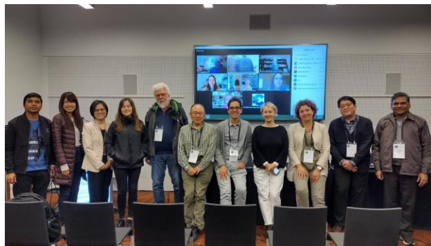
1 - The RC49 business meeting.

The next ISA World Congress of Sociology (XXI) will take place in Gwangju, Korea, July 4-10 2027.