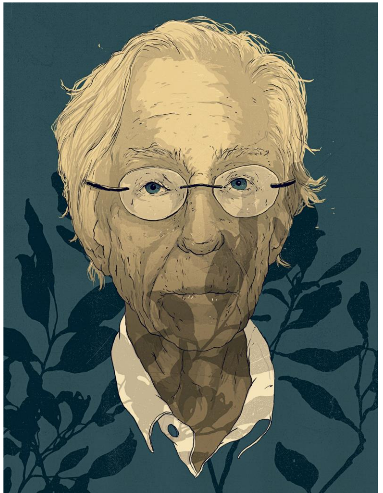
Illustration by Simon Prades, The New York Times , January 5, 2015