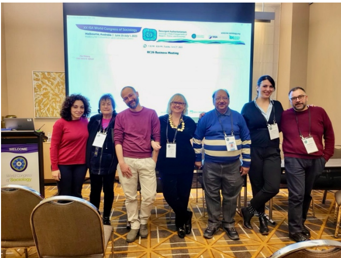
RC26 members at the Congress