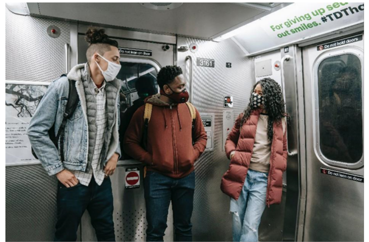
Pandemic-facilitated sociability.

on multiple fronts, a focus on everyday sociability may seem trivial at first glance. This focus matters though, as we develop a distinctive approach concerned with examining how sociability is generated and what it generates in our increasingly dense and diverse urban milieux. Based on our work over the last four years, we present three key insights into understanding public spaces as spaces of sociability.